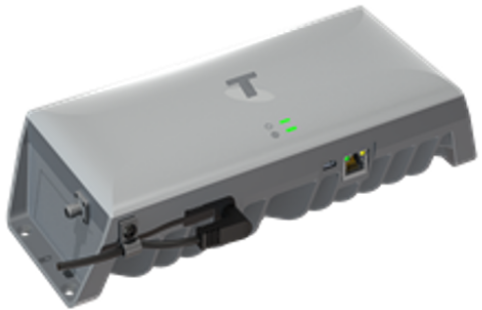
Telstra GO G41 Stationary Repeater