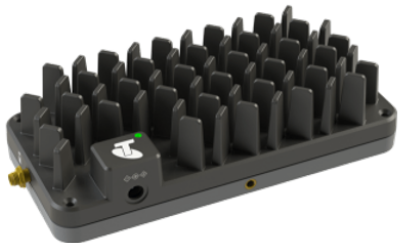
Telstra GO ROAM R41 Mobile Repeater